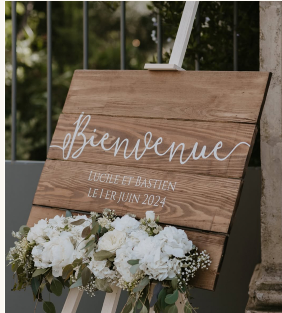
Welcome sign florals