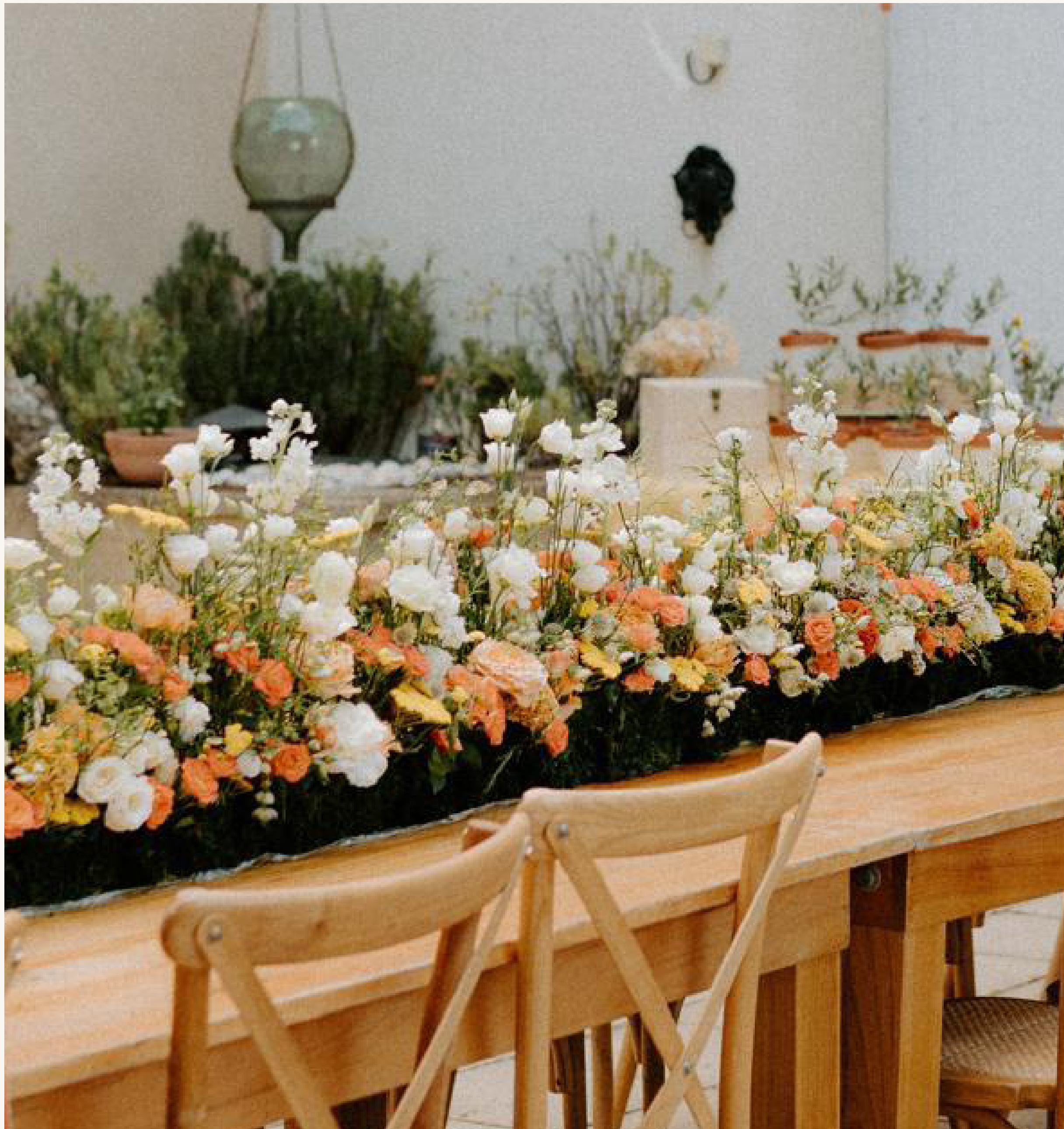
Table runner garland