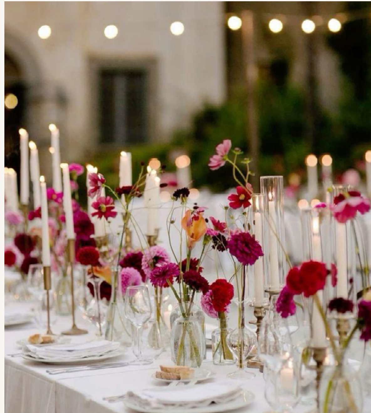
Single-stem flower arrangement