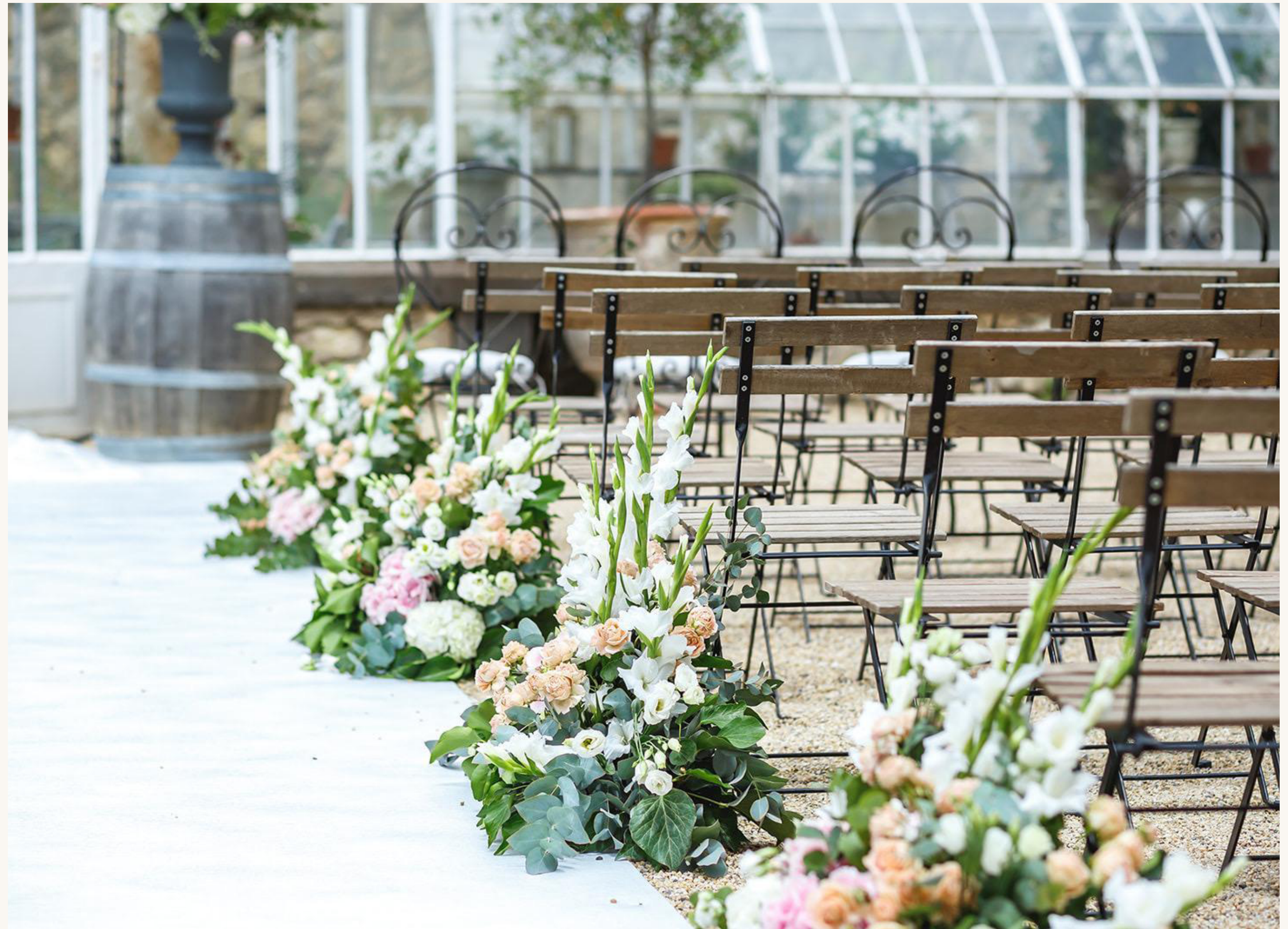
Ground floral arrangement