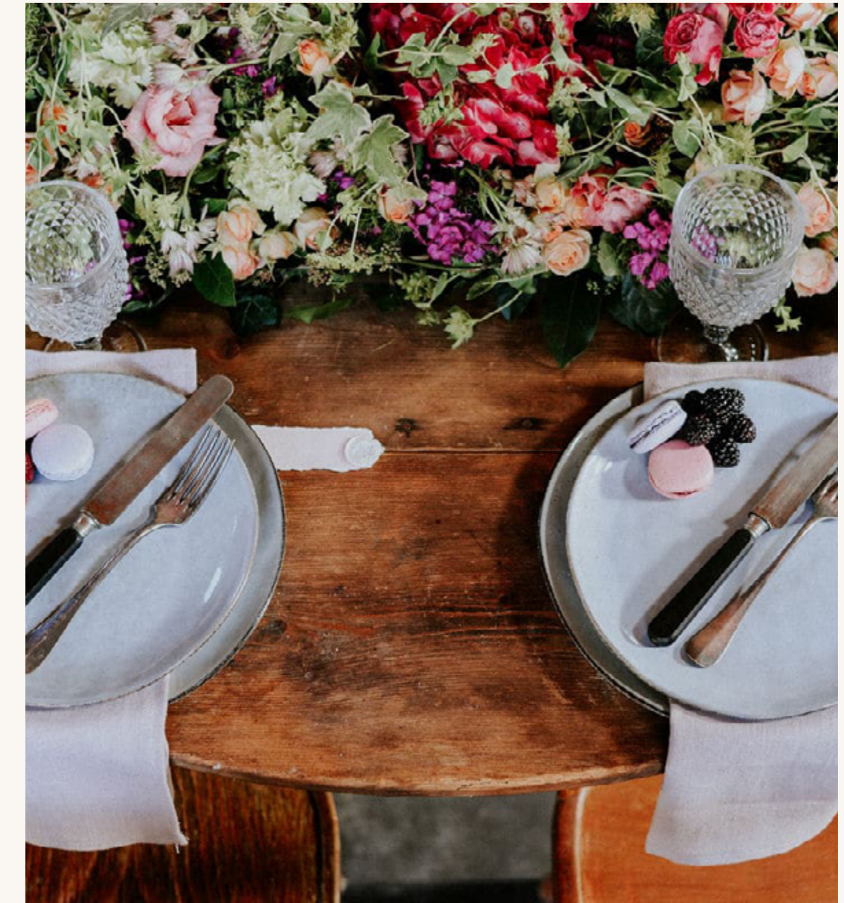
Table runner garland