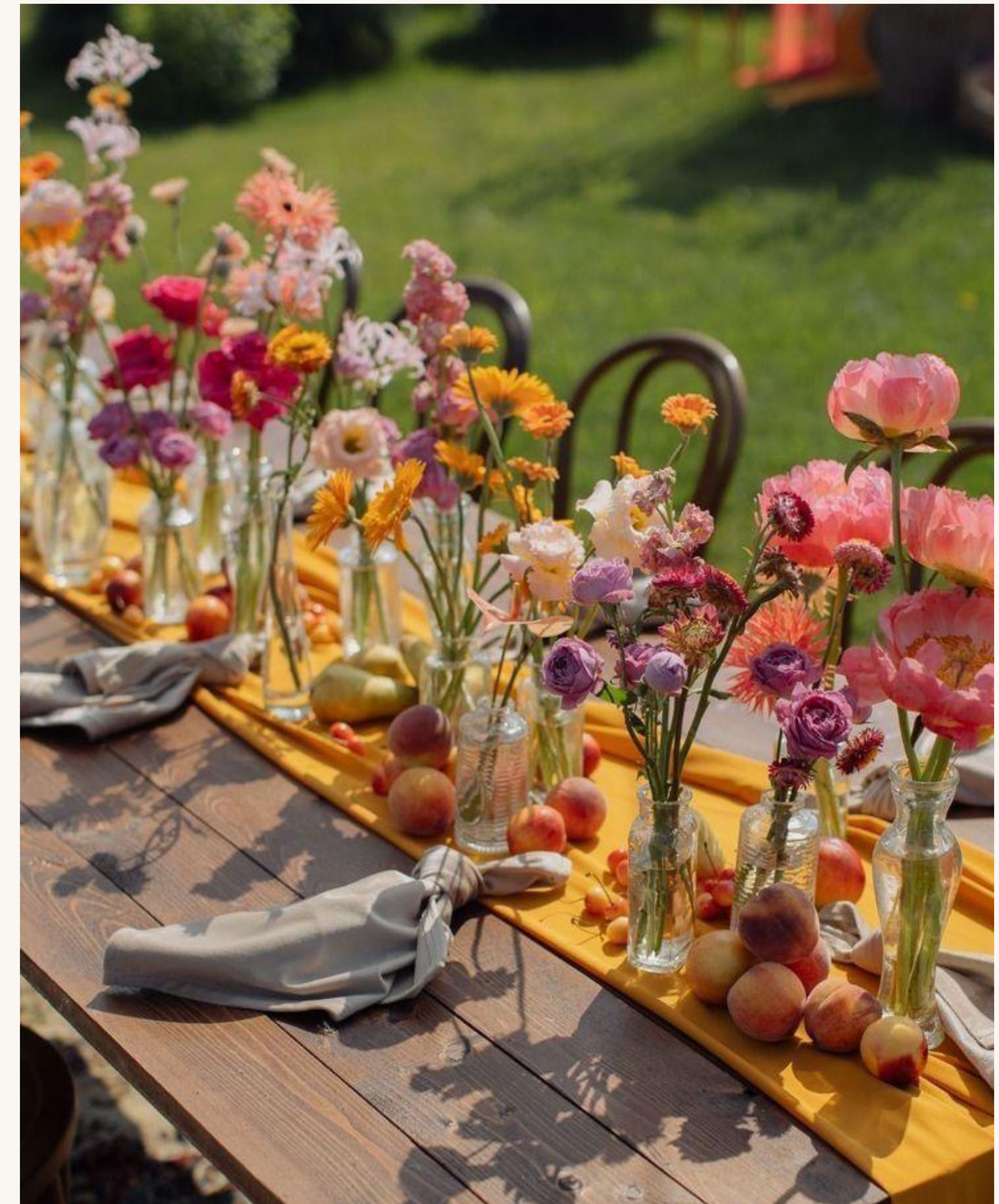
Single-stem flower arrangement