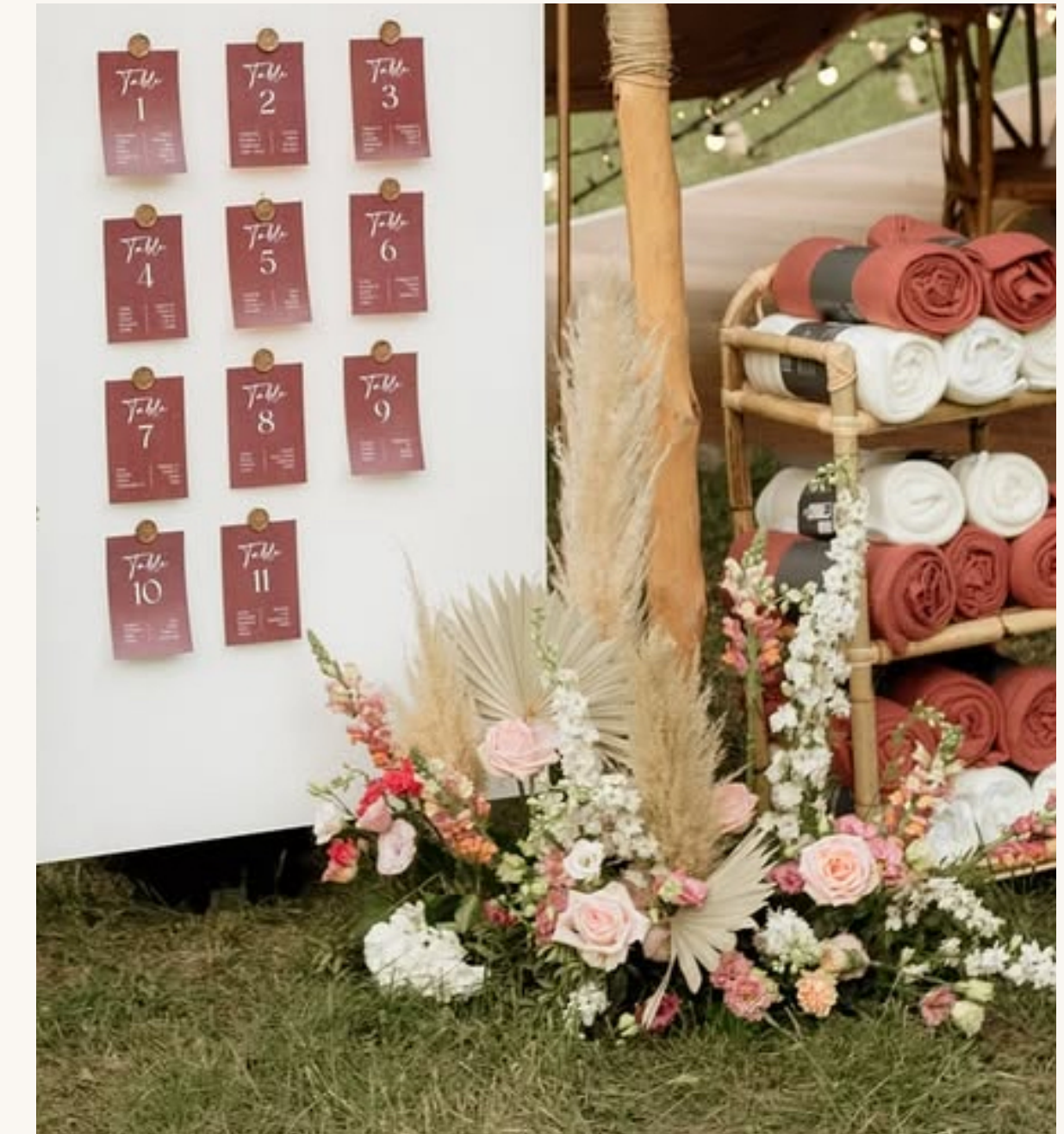
Table plan florals